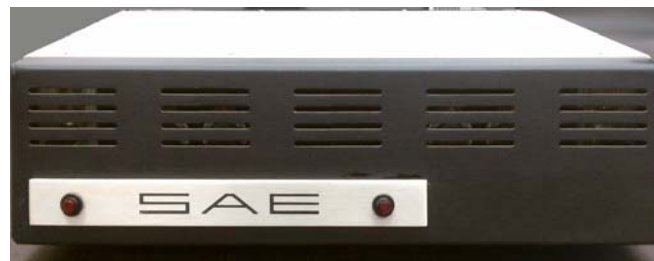
The SAE Mark 2