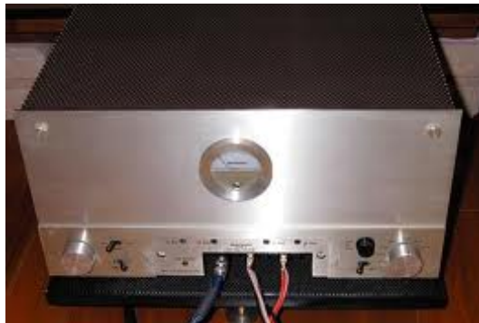
The Marantz 9